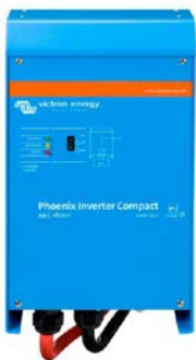
Phoenix Inverter Compact 24/1600

The possibilities of paralleled high power inverters are truly amazing. For ideas, examples and battery capacity calculations please refer to our book 'Energy Unlimited' (available free of charge from Victron Energy and downloadable from www.victronenergy.com ).